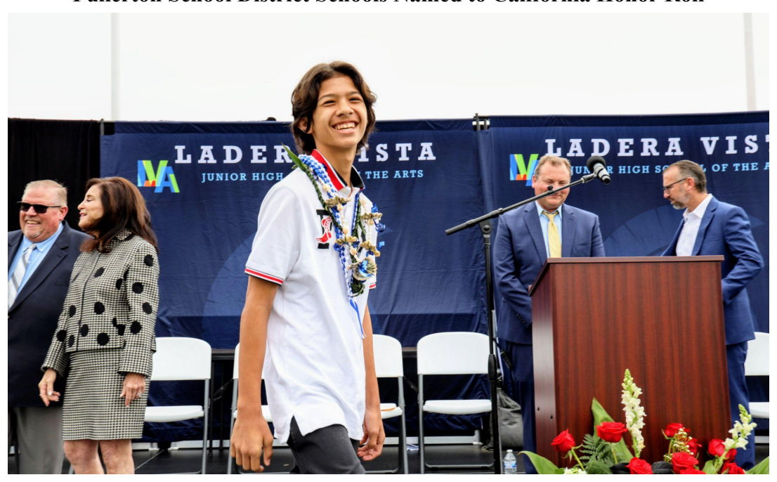
FSD's Ladera Vista Junior High School of the Arts is one of seven FSD schools named to ERP's 2024 California Honor Roll.

(Fullerton, CA) - Fullerton School District (FSD) schools have made the grade earning a spot on Educational Results Partnership's (ERP) prestigious California Honor Roll. In its ninth year, this esteemed recognition program highlights public schools that have excelled in closing achievement gaps and elevating educational outcomes, particularly among higher-poverty and historically disadvantaged student populations.